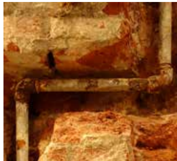
Crumbled plumbing throughout building will be replaced

Work has begun on repairing, replacing and reconfiguring our mechanical, electrical and plumbing systems, and in providing modern, accessibility and safe spaces in our church buildings. We need your help to reach our fundraising goal. Please help us continue to serve the South Loop Community by giving to our Sacred Places and Safe Spaces Capital Campaign today.